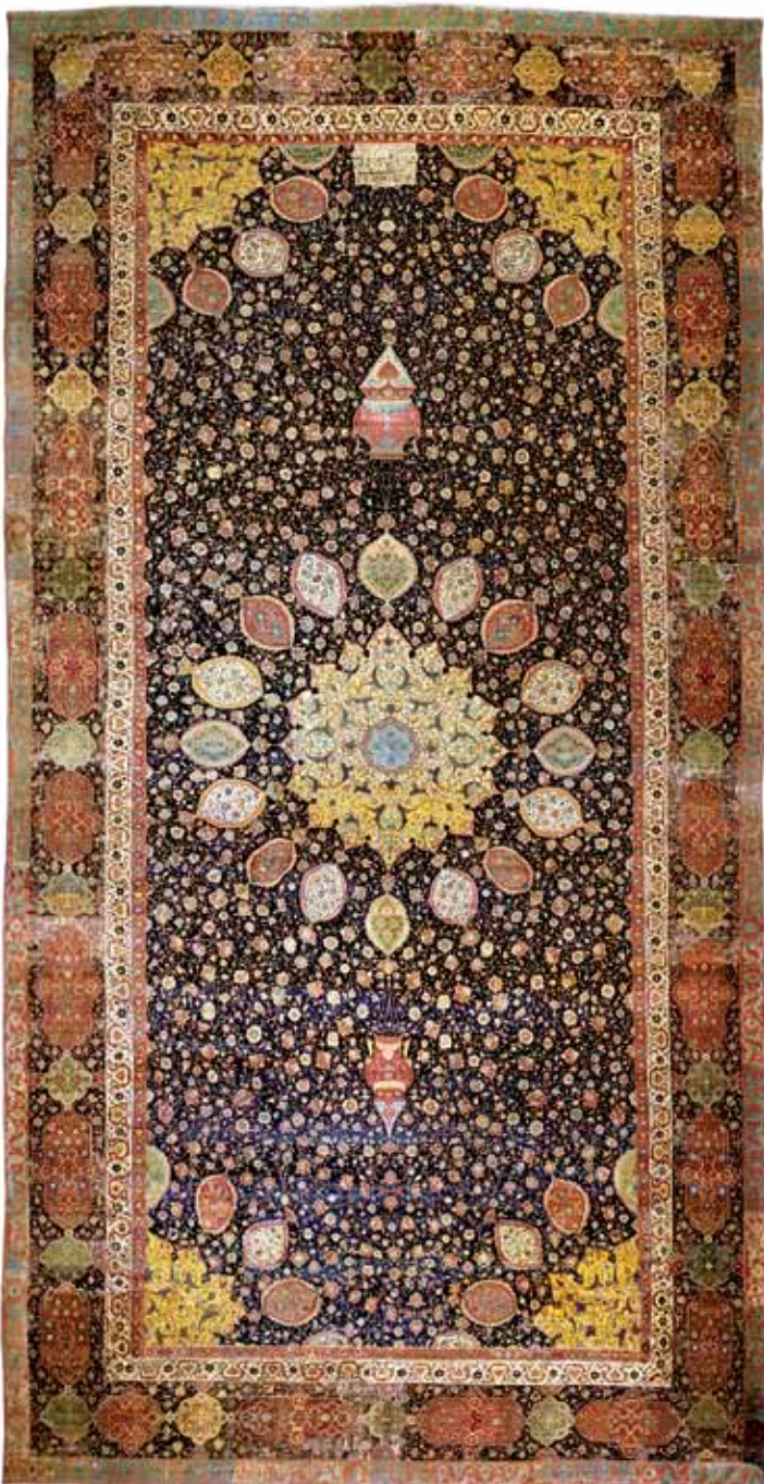
The world's most famous and most priceless Oriental carpet: "The Ardabil"; 1539-1540; Unknown maker

Art lovers and collectors are drawn to tradition and craftsmanship for several reasons. It could be that the aesthetics or the rarity of the items produced may yield a considerable financial return over time, or simply that the pleasure of owning something so precious and beautiful might be gratifying enough.