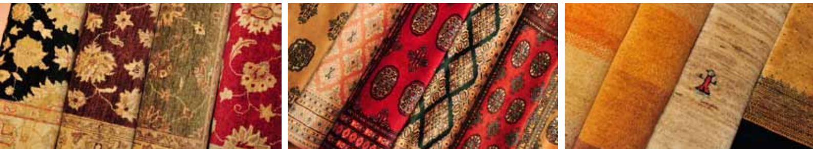
Above, from left to right: Four rugs with the timeless, much-loved 'Shah Abbas' Persian motif; The various famous Central Asia 'Bokhara' motifs in glorious colours, ideal for both classic and contemporary settings; Four examples from Victor's hand-made Orientals – VL Contemporary Collection.

VL: One, choose what you spontaneously love, and feel you won't tire of. Don't be afraid to be original! Even adventurous! Don't be swayed by the opinions of others. You